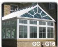
GC - G16

One of our most popular designs and comes in a variety of styles and spoke variations from between 3 and 7 spokes. As its name suggests it portrays the sun halfway over the horizon with its bars radiating from the curved transom. The design pictured to the right is GC-G16 .