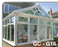
GC - G16