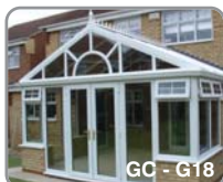
GC - G18